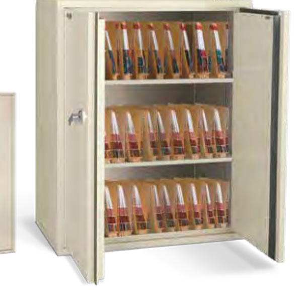
Vlade in th U.S.A.