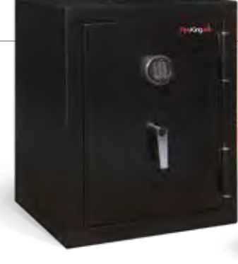
Comes standard with 2 adjustable shelves.