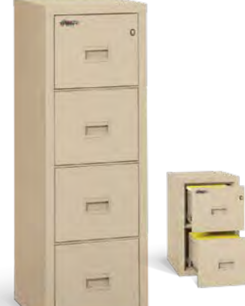
Made in th U.S.A.