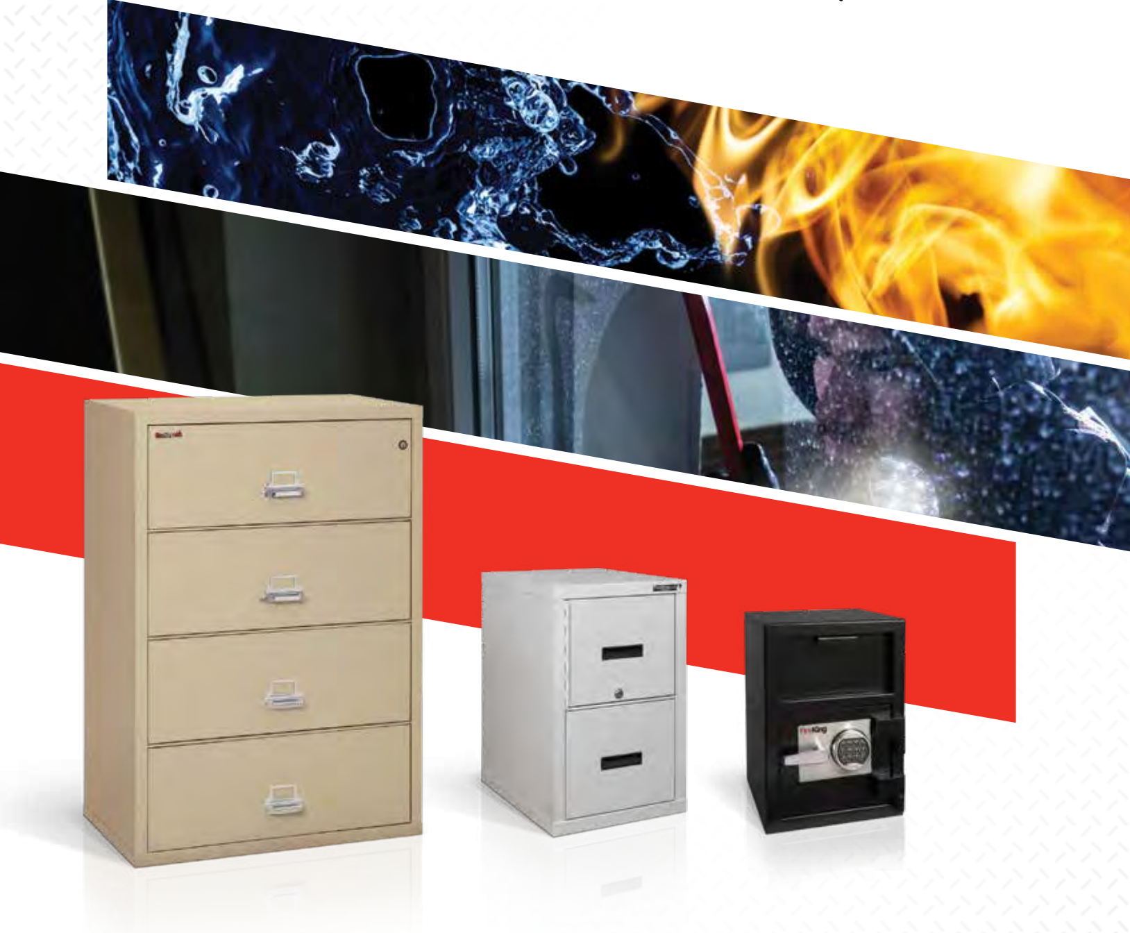
Protecting What's Important FOR OVER 65 YEARS