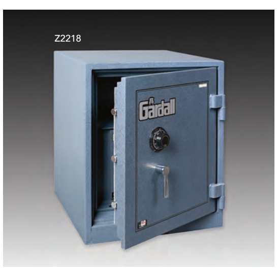
Designed for complete protection of your valuables, a "B" rated burglary safe securely welded inside a 2-hour fire resistive safe.