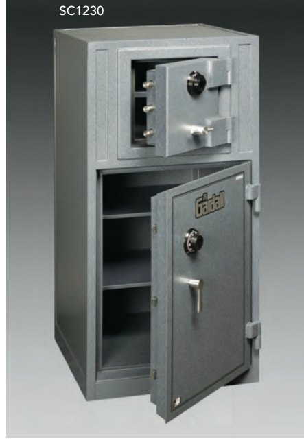
Safe/Chest Combo TL15 Chest with 2 Hour Fire Safe below